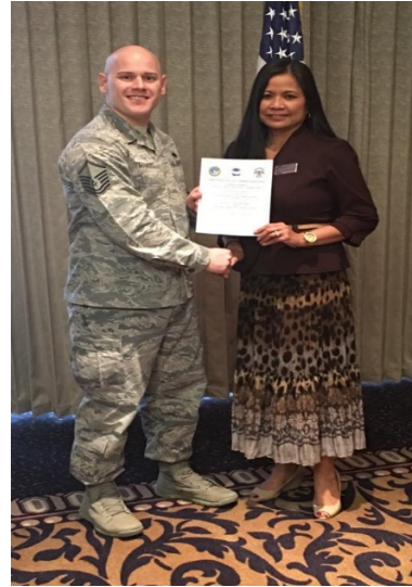
AAFES Tinker Main Exchange team