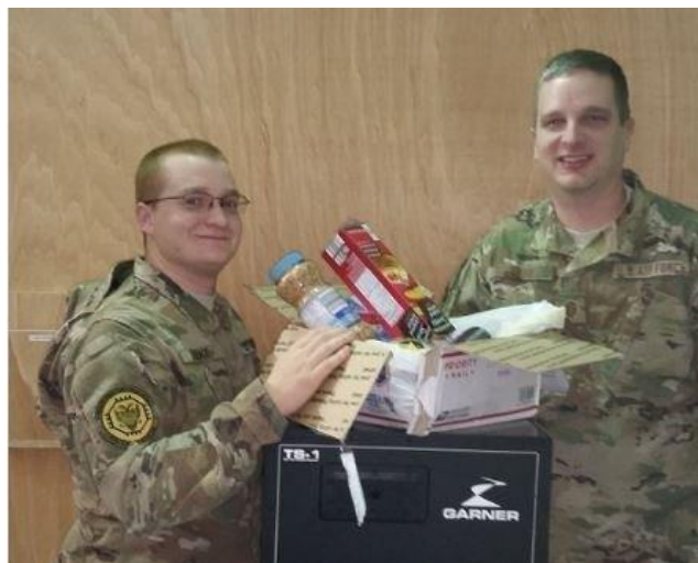
Deployed 128 th ANG members with care packages from Chapter 851