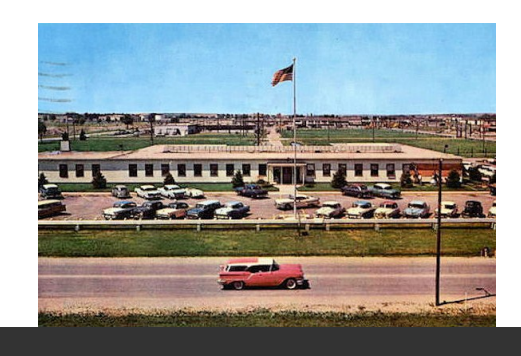
818TH AIR DIVISION HEADQUARTERS, LINCOLN AFB, NEBRASKA

The end started in 1965 with the deactivation of the 307<sup>th</sup> and the 818<sup>th</sup> and was quickly followed by the removal of the Atlas ICBMs and deactivation of the 551<sup>st</sup>. Eleven years after the first B-47 arrived in Lincoln, the last aircraft departed the base and by mid-1966 this once major AFB became a footnote in history.