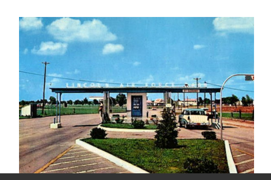
LINCOLN AFB FRONT GATE

Over the years, I have collected hundreds of pieces of Air Force memorabilia, much to the consternation of my wife. One piece that I acquired several years ago was a miniature postcard booklet for Lincoln AFB, Nebraska. Until that point I hadn't heard of Lincoln AFB even though I grew up in Nebraska. I remember driving by the Air National Guard base when I would drive home from F.E. Warren AFB but never really gave much thought to there ever being an active duty Air Force Base in Lincoln.