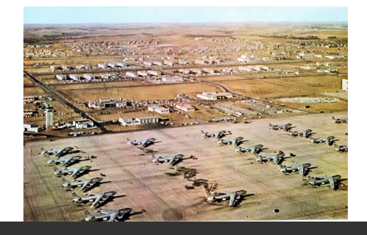
B-47 STRATOJETS ON THE FLIGHTLINE AT LINCOLN AFB, NEBRASKA

12 Atlas Intercontinental Ballistic Missiles. Once the missiles became operational in 1962, along with a US Army Nike missile sites, things were looking very good for the longevity of Lincoln, but the base's quick rise was rivaled by its equally quick descent.