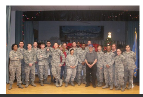
MEMBERS OF AFSA CHAPTER 951 WENT TO THE SOUTH DAKOTA VETER-ANS HOME IN HOT SPRINGS, SD ON 2 DEC 2011 TO HELP PUT UP CHRIST-MAS DECORATIONS FOR THE RESIDENTS AND SING CAROLS.