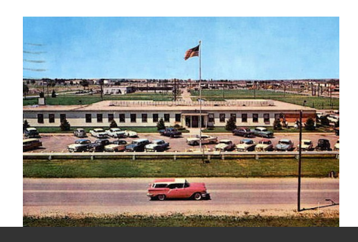
818TH AIR DIVISION HEADQUARTERS, LINCOLN AFB, NEBRASKA

In 1960, the base saw further growth with the addition of the 551<sup>st</sup> Strategic Missile Squadron and