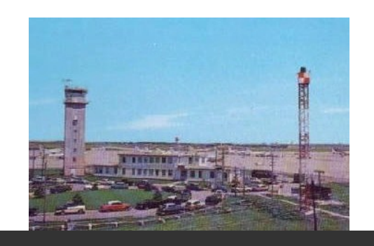
BASE OPERATIONS, LINCOLN AFB, NEBRASKA