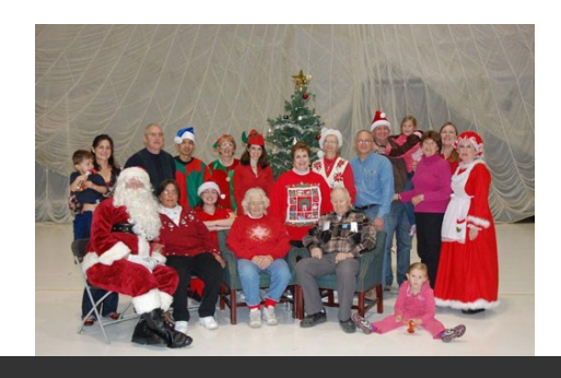
MEMBERS OF CHAPTER 851 AND A851 AND THEIR FAMILY MEMBERS IN THEIR LAST OFFICIAL FUNCTION AS A CHAPTER AND AUXILIARY