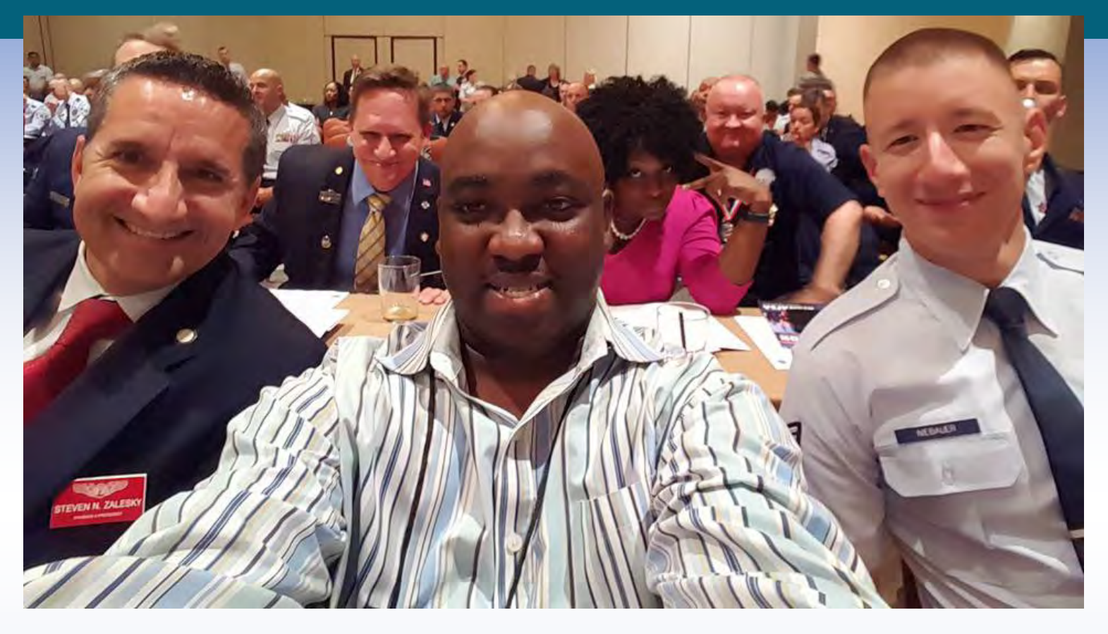
Experiencing the 2016 AFSA PAC in San Antonio, TX, members of D3 now how to have fun. Tag...You're It.