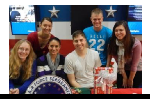
CHAPTER 985 MEMBERS WORKING THEIR ANNUAL CHRISTMAS PRESENT WRAPPING FUND RAISER

In addition: Volunteers collected over 300 toys from local business to support Tinker AFB Families.