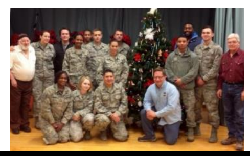
CHAPTER 951 MEMBERS DECORATING THE SOUTH DAKOTA VETERANS HOME ON DECEMBER 2ND