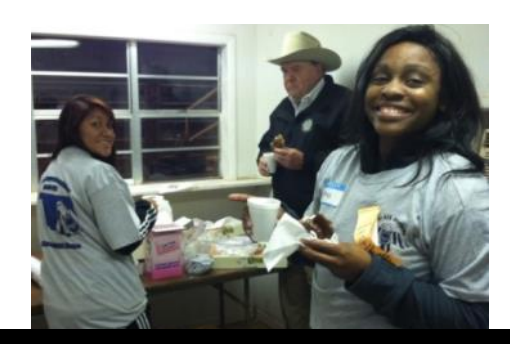
CHAPTER 985 VOLUNTEERS WORKING THE STILLWATER, OK SPECIAL OLYMPICS HORSE RIDING COMPETITION

This year our team of volunteers hit the road again on our 9th Annual AFSA Traveling Road Show for Special Needs Adults "Christmas Edition" held on Saturday, December 7th, 2013. Due to driving hazards from the ice and snow, and care homes scheduling conflicts, 5 volunteers visited, performed for the 85 residents at the home closest to the base instead of homes at 4 cities for 350 total residents and 400 miles normally driven. The tour consisted of DJ set up, costumes and a stuffed animal for each resident. As usual the joy of the recipients was priceless — truly a blessing - this is what it's all about!!