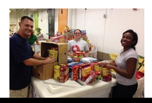
VOLUNTEERS WORKING AT THE FOOD BANK IN OKLAHOMA CITY