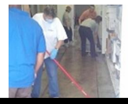
CHAPTER 985 MEMBER HELP CLEAN THE OKLAHOMA CITY ANIMAL SHELTER

Chapter 985 had 11 volunteers help out at the Oklahoma City Animal Welfare Division by organizing and cleaning out a storage space. It was hard work but very rewarding in the end when we got to spend time with the animals up for adoption.