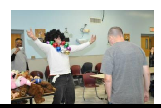
A CHAPTER 985 MEMBER PERFORMS FOR THE CROWD AT A LOCAL HOME FOR SPECIAL NEEDS ADULTS

This year our team of volunteers hit the road again on our 9th Annual AFSA Traveling Road Show for Special Needs Adults "Christmas Edition" held on Saturday, December 7th, 2013. Due to driving hazards from the ice and snow, and care homes scheduling conflicts, 5 volunteers visited, performed for the 85 residents at the home closest to the base instead of homes at 4 cities for 350 total residents and 400 miles normally driven. The tour consisted of DJ set up, costumes and a stuffed animal for each resident. As usual the joy of the recipients was priceless — truly a blessing - this is what it's all about!!